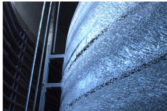
Interior of energy storage

One Vitocal 300-G 17 kW heat pump unit and a 20 m 3 energy storage system have been installed.