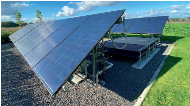
E-PVT thermal hybrid solar collector plant. 20 panels whose total electric power is 6.5 kW p and thermal power is 17 kW.