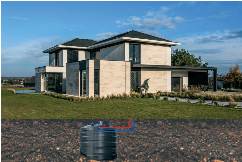
20 m 3 17 kW pre-fabricated storage of energy.

An innovative energy system that generates heat in winter and cools rooms in summer and in addition generates electricity in an E-PVT thermal hybrid solar collector plant.