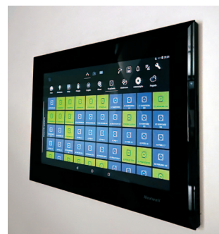
Smart home control panel.